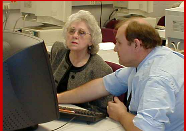
A jobseeker gets help with computer skills

In the JobSight's impressive Career Resource Center, job seekers can use computers and the internet, a fax machine, photocopier, printer, resume-writing software, and helpful books and videos to help conduct their job searches. Use of the Career Resource Center is free.